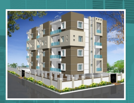
NAVYA SAI NIVAS At Kondapur