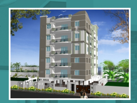
NAVYA GLASS EMERALD at Malakpet