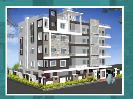
NCR NAVYA SAPPHIRE At Kondapur