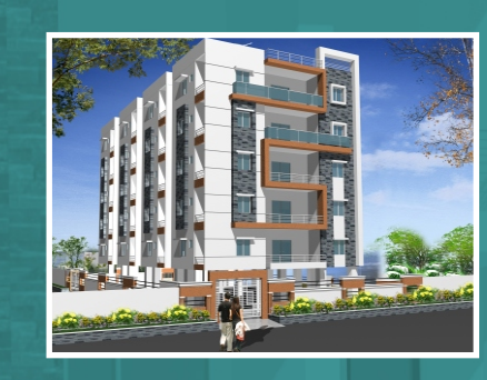
NAVYA MEADOWS At Penamaluru, Vijayawada